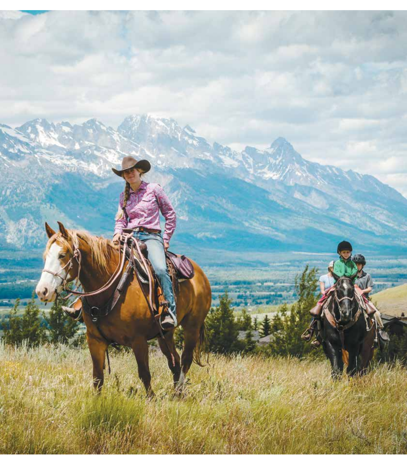
Spring Creek Ranch trail rides offer unobstructed views of the Tetons.