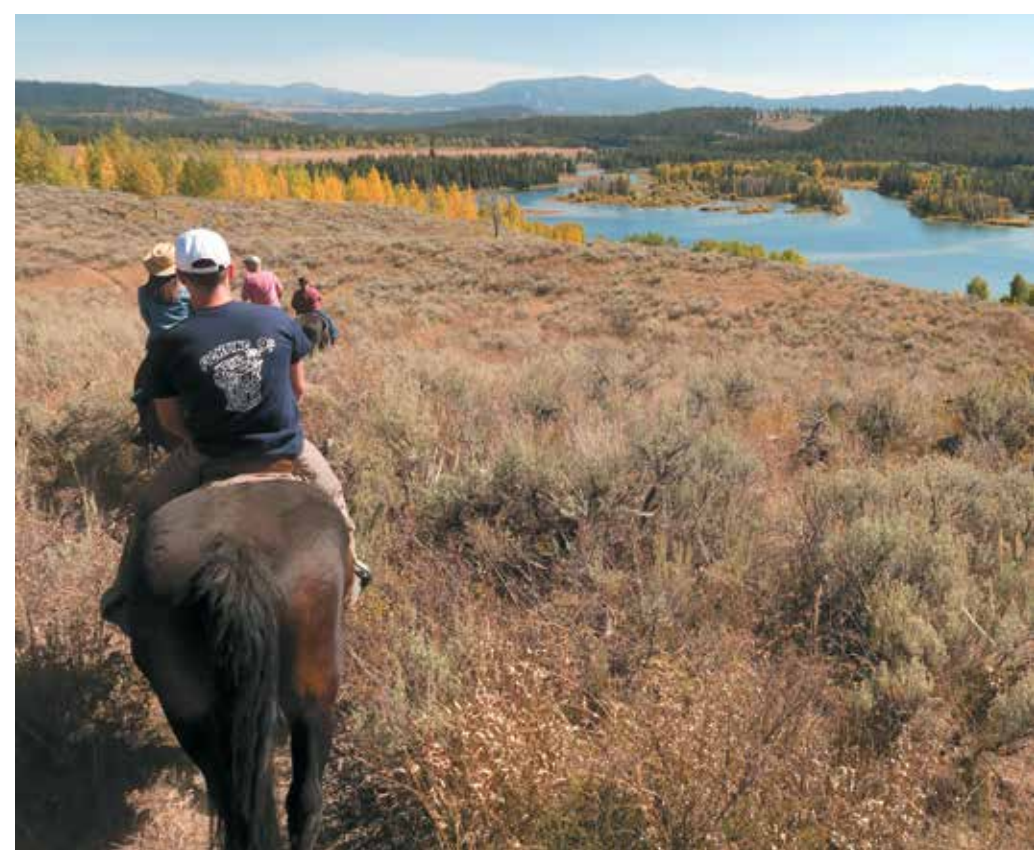
Some rides from Jackson Lake Lodge climb up a butte overlooking the Snake River.

Matilda Lake. Just as the ride is about to end and we pass under a bridge that's part of the road to Yellowstone, Rusty shares a final bit of trivia about the bridge, which has higher guardrails on one side (its west side) than the other. "Lady Bird Johnson was out here on vacation and found that the rail interfered with the views of Christian Pond. They cut off the top rung the same day she complained." (Editor's note: We're unable to fact-check this tale, but this bridge's guardrail is lower on its east side than the west.)